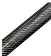
20-F-AC-7020 2” x 5’ Extension Pole