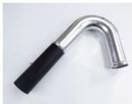
20-F-AC-7045 135 Degree Aluminum Head