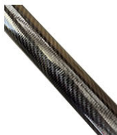
20-F-AC-7015 * 2” X 2.6’ Pole