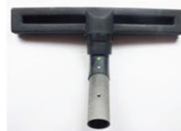
20-F-7030 * Flat Surface Tool 15-1/2” Wide