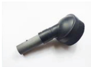
20-F-7025 * Large Round Brush