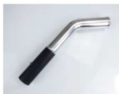
20-F-7055 * 45 Degree Aluminum Head