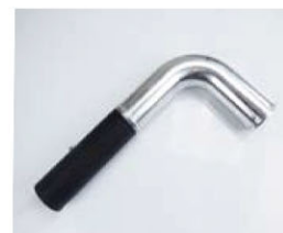
20-F-AC-7050 90 Degree Aluminum Head