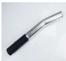
20-F-7060 15 Degree Aluminum Head