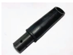
20-F-AC-7040 Conductive Rubber Conical Nozzle