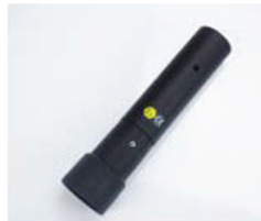
20-F-7065 * Pole to Hose Adapter

20-F-7080 Standard Kit includes each of the above * items (Add 20-F-AC-7020 quantities as desired for total length needed)