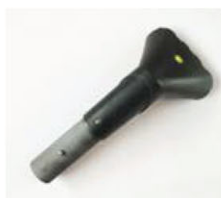
20-F-AC-7035 Conductive Gulper Nozzle